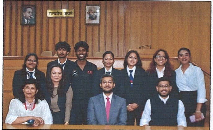
The Mock Mediation & Client Counselling Team