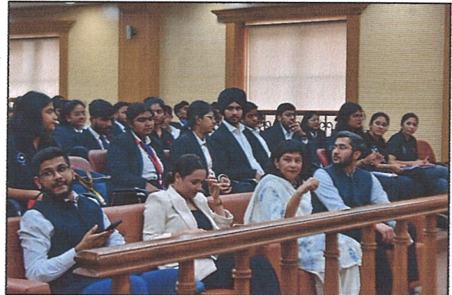
Day 01, Session 01- Arrival of our Esteemed Guest Speakers